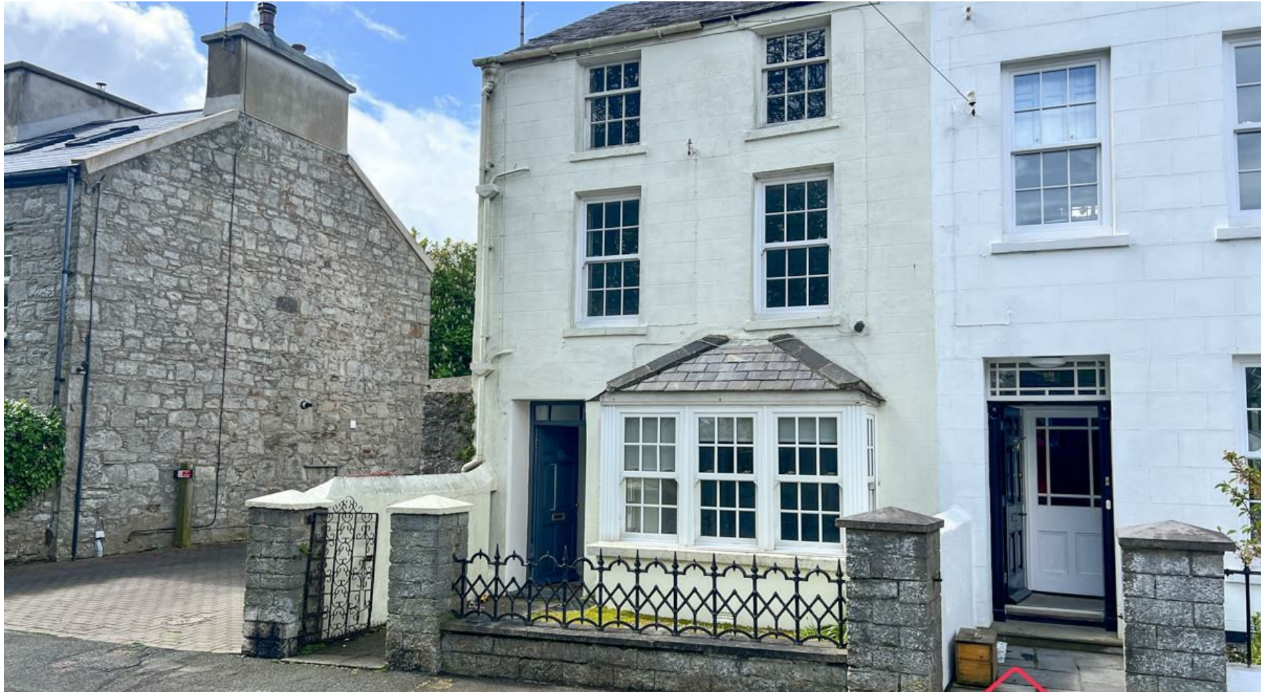
18 The Crofts, Castletown, Isle of Man, IM9 1LY Asking Price £399,950